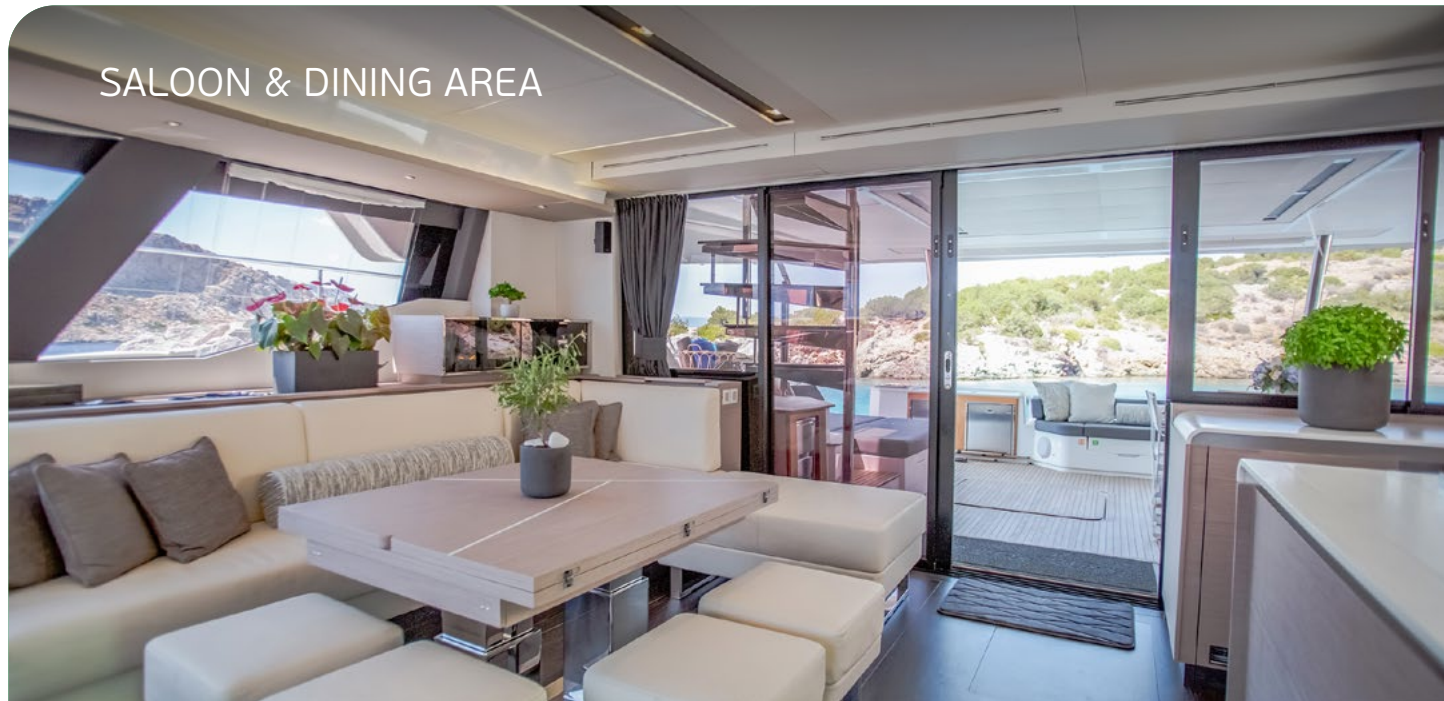
SALOON & DINING AREA